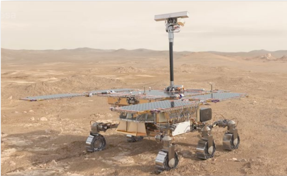
Artist's impression of ESA's ExoMars rover on Mars.